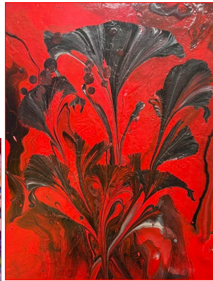
Drag chains slowly over top of canvas to create the flowers.