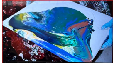
Tilt canvas to spread paint