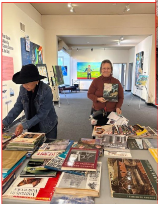
Bargin Table Winners