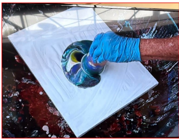
Pour from cup