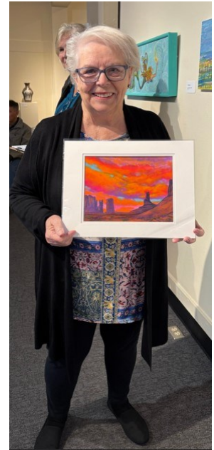
JAN Art of the Month paintings