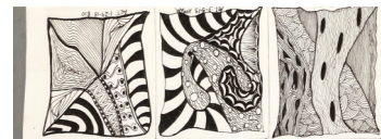
samples of patterns