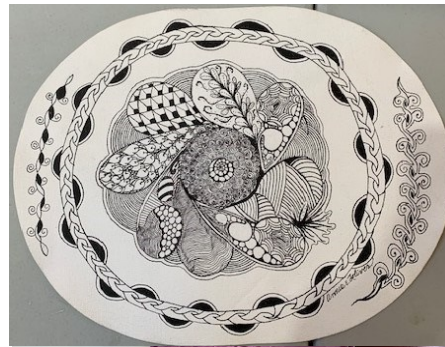
paper bag used