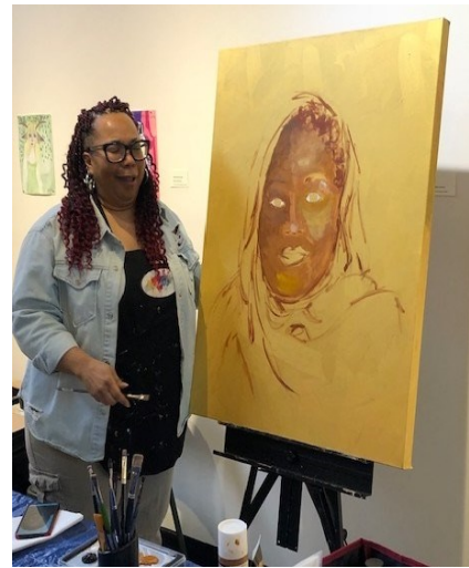
Minimum brush cleaning