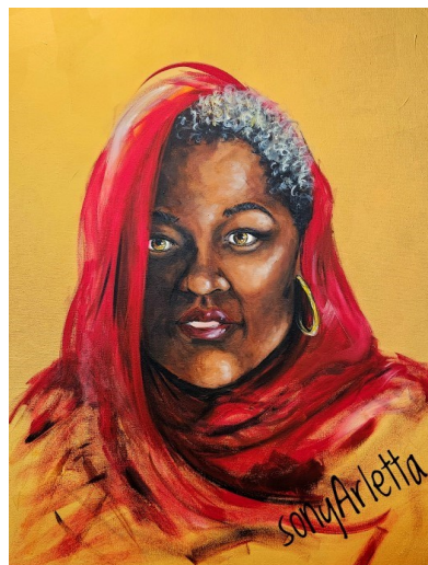
The Beauty of Wisdom