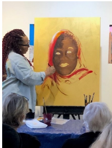
Adding that perfect shade of red to pop the image