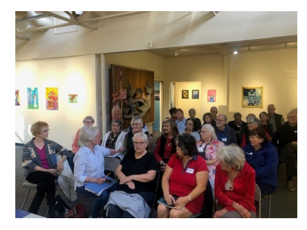
Brief Newsletter report given