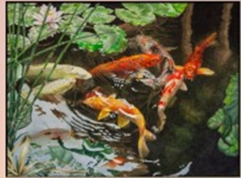
"Koi Buddies" watercolor by Janet Castro

Upland Public Library Display: Sept. 10 – Sept. 29 Participants will be notified: Sept. 4 Drop off Upland Public Library: Sept. 9, 10:00 AM - 3:00 PM Award Judging : Sept. 10 Awards Announced: Sept. 13, AAIE meeting Pick Up: Sept.30, 10:00 AM - 3:00 PM