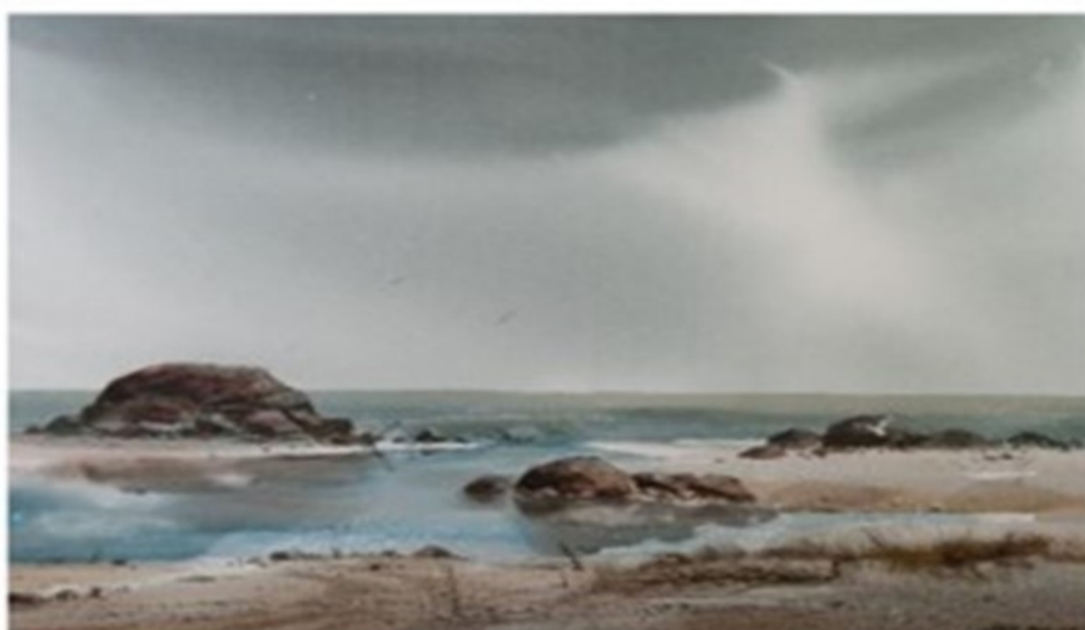
Beach Front Fred Leach Watercolor - 1981

At the museum | 217 S. Lemon Ave., Ontario