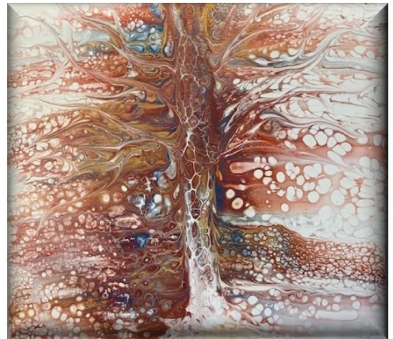
Swipe Tree method