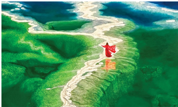
Lixian Han, Jade Salt Lake , 2023, Acrylic