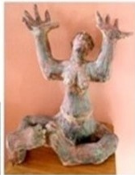
In Memorium – Alan Swartz