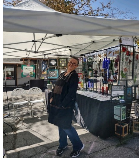
FW: Richter Rules

Gerhard Richter is considered one of the most important contemporary living German artists. Born 90 years ago in Dresden, he paints photo based bright color abstractions. He created 1,671 paintings after a major stroke. Here are his self professed art rules: